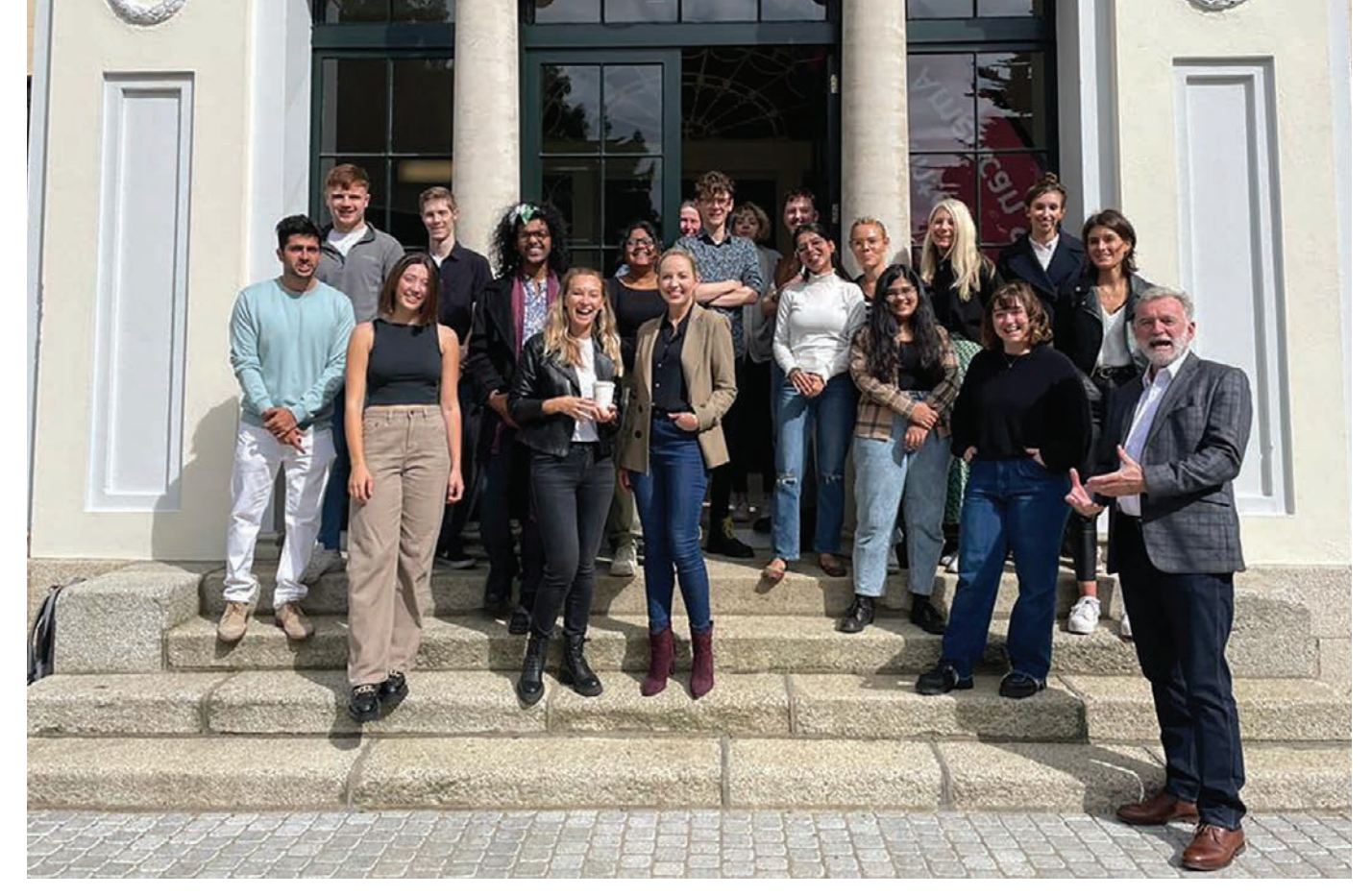
MA in Journalism and International Affairs Class, 2022